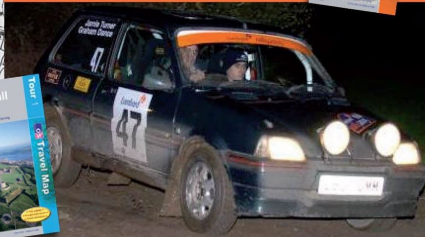
Basic Roamer Endurance © 1:100 000, 1:50 000 & 1:63 360 1in/mile scales