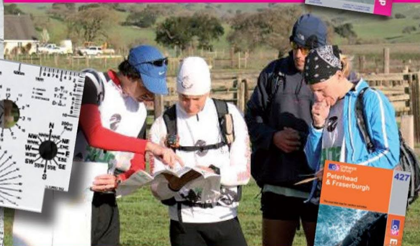
Basic Roamer 6v2 © 1:25 000 & 1:50 000 scales